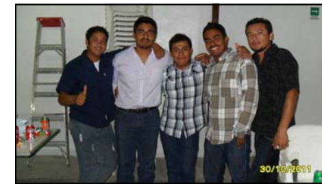
This is a recent photo of some of our students. They are looking so healthy and happy!